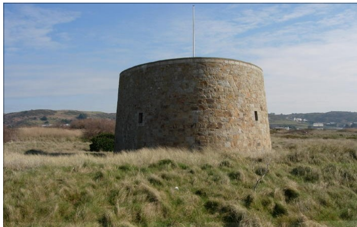
Kempt Tower Martello

My operation was limited to mainly all night operation, when the other ops were back at the guesthouse sleeping, because of interference between the four stations. Two of the stations were